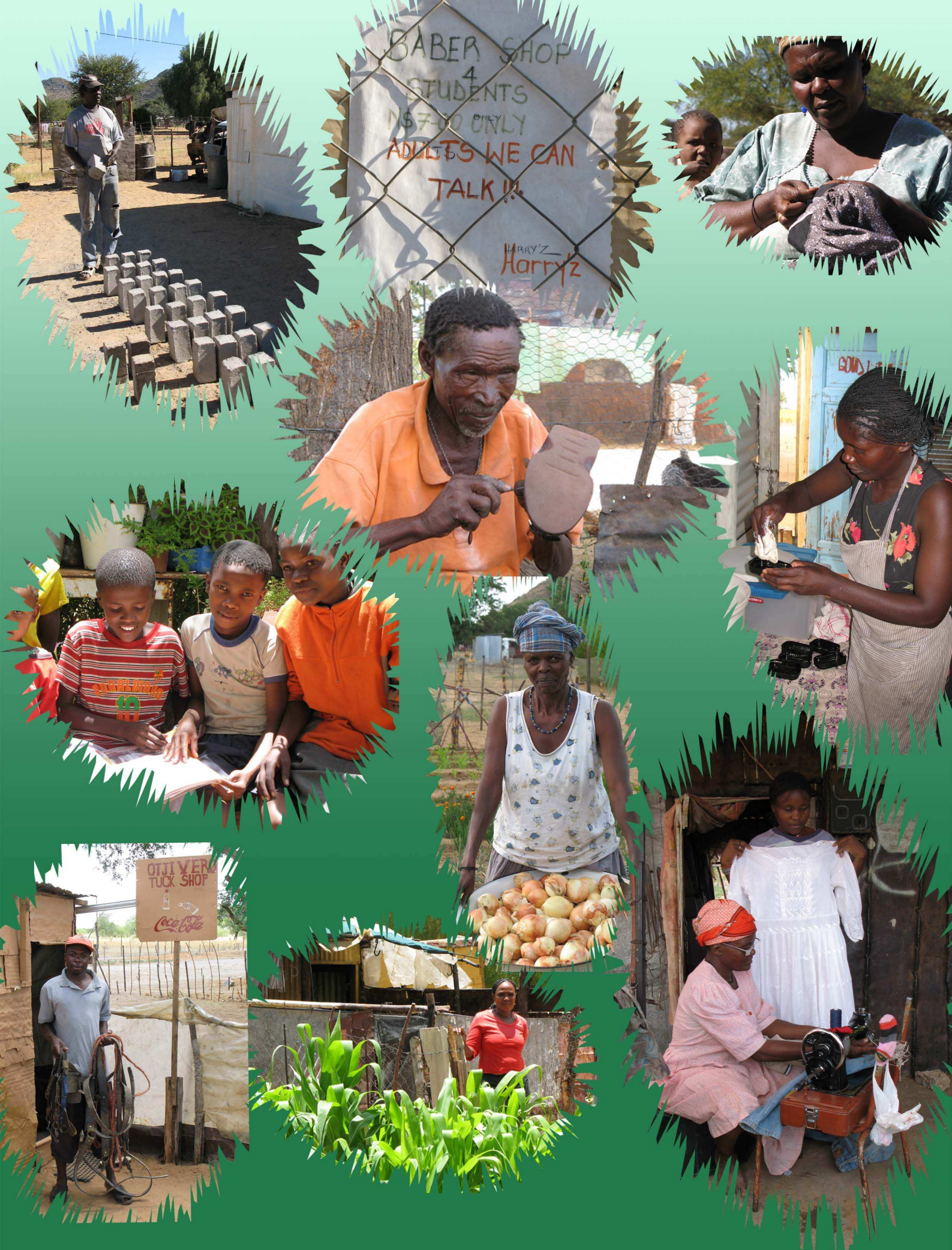
The Basic Income Grant Pilot Project in Otjivero-Omitara