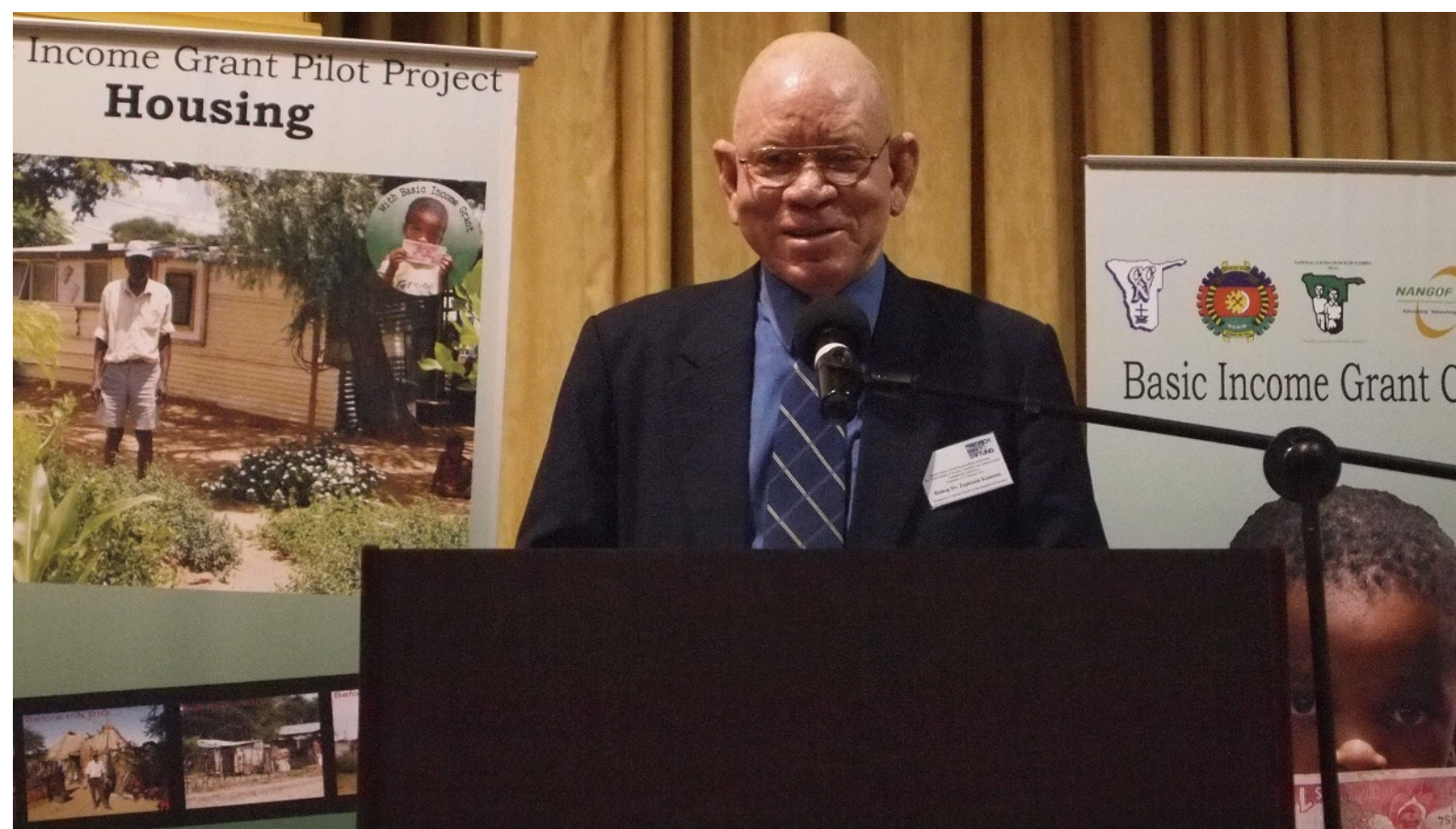
Bishop Kameeta at a Friedrich Ebert Foundation Conference in 2011

Eigowas clearly links the suffering of the dying woman to the inaction of government to take up a national basic income. "The truth of the matter is", she says, "I honestly do not know where the money of the government has gone to. This is at the heart of the problem. They claim that there is no money, but their employees are paid at the end of the month. Where do they get this money from? To me it seems to be a tale, there are more than 60,000 government employees, they get their salary every month. So the government should just bring back the BIG, even if it is at first only N$50 a month and then increased by N$50 every year."